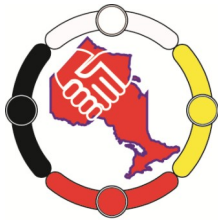
Ontario Regional Addictions Partnership Committee (ORAPC) Logo symbolizes the partnership that exists across the Ontario Region.

The ORAPC Coordinator attended the All Ontario Chiefs Conference hosted by Whitefish River First Nation on Manitoulin Island in June.